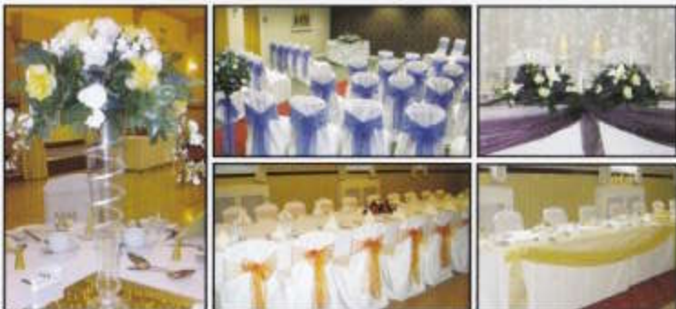
Table Decorations • Starlight Backdrop Hire